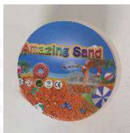
Xiaohong-3.png Main picture