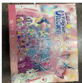
81ZuYHfqfGL.jpg Main picture