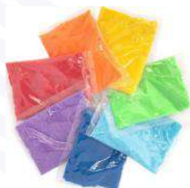
sable-de-jeu-blacklist-1.png Main picture