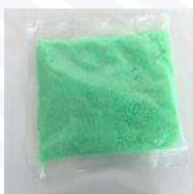
Screenshot 2026-02-18 122216.jpg Main picture