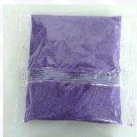
Baker Ross 2.png